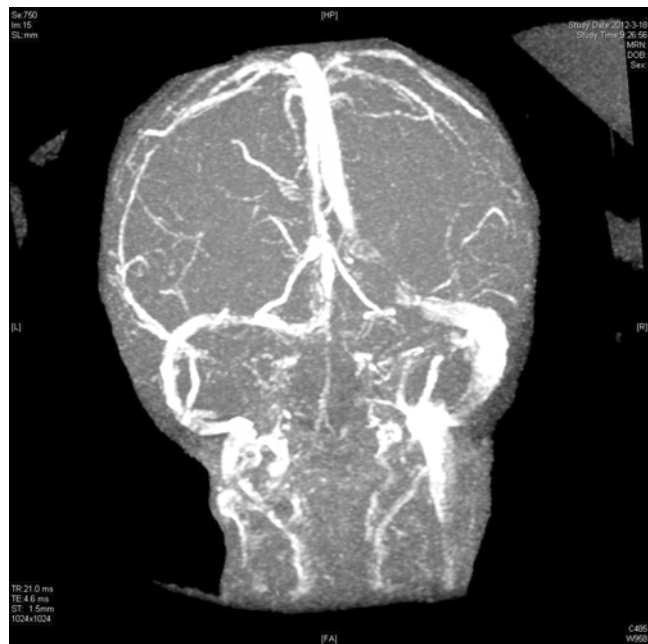
Fig. 1. MRV shows invasion and occlusion of the intracranial venous sinus.

Most of the CT images showed mixed- and high-density shadows; a few only showed high-density shadow and cystic degeneration but no calcification. MRI showed equal T1 signal, and high or mixed T2 signal. We saw 13 lobulated cases, 12 cases with necrosis, cystic degeneration and/or uneven enhancement, and 7 cases with void vessels or blood flow shadows. Two patients had skull invasion and in-extracranial communication.