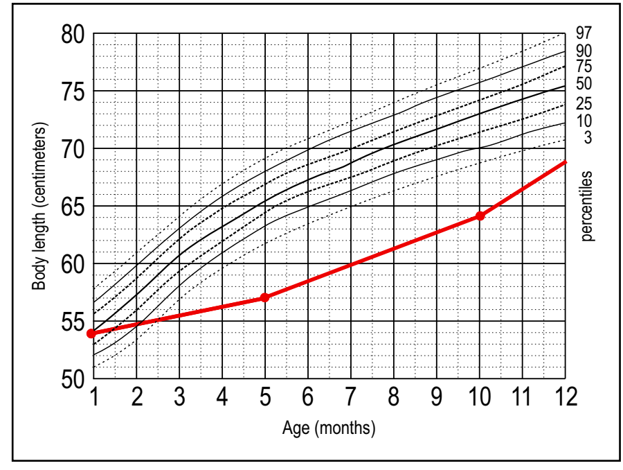
Fig. 1. Patient's body lengths in the first 12 months of life