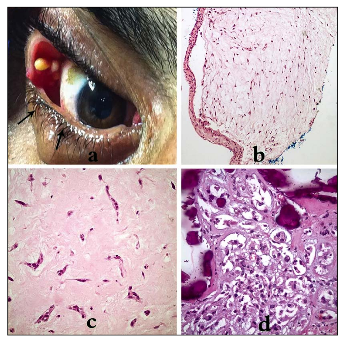
Figure 1.a. Solid papules on upper eyelid b . Eyelid superficial angiomyxoma consisting of polypoid shape, hypocellular, myxoid neoplasm without atypia and quite a few vessel c . Myxoma cells are seen as elongated, fusiform or stellate with oval or elongated nuclei and eosinophilic cytoplasm, d . Eosinophilic large neoplastic cells consisting of myxoid matrix calcification on testes.

A man aged 46 years with a medical history of cardiac myxoma excision from the left atrium when he was aged 39 years old was admitted our hospital because of three newly-developed cardiac masses. On transesophageal echocardiography, masses in the right atrium measured 4.5 \times 5.8 cm and the atrium was prolapsing through the tricuspid valve into the right ventricle. The largest of the three masses ( 1.7 \times 1.2 cm) was in the left atrium. Preoperative thoracic computerized tomography (CT) demonstrated multiple bilateral pulmonary emboli. The