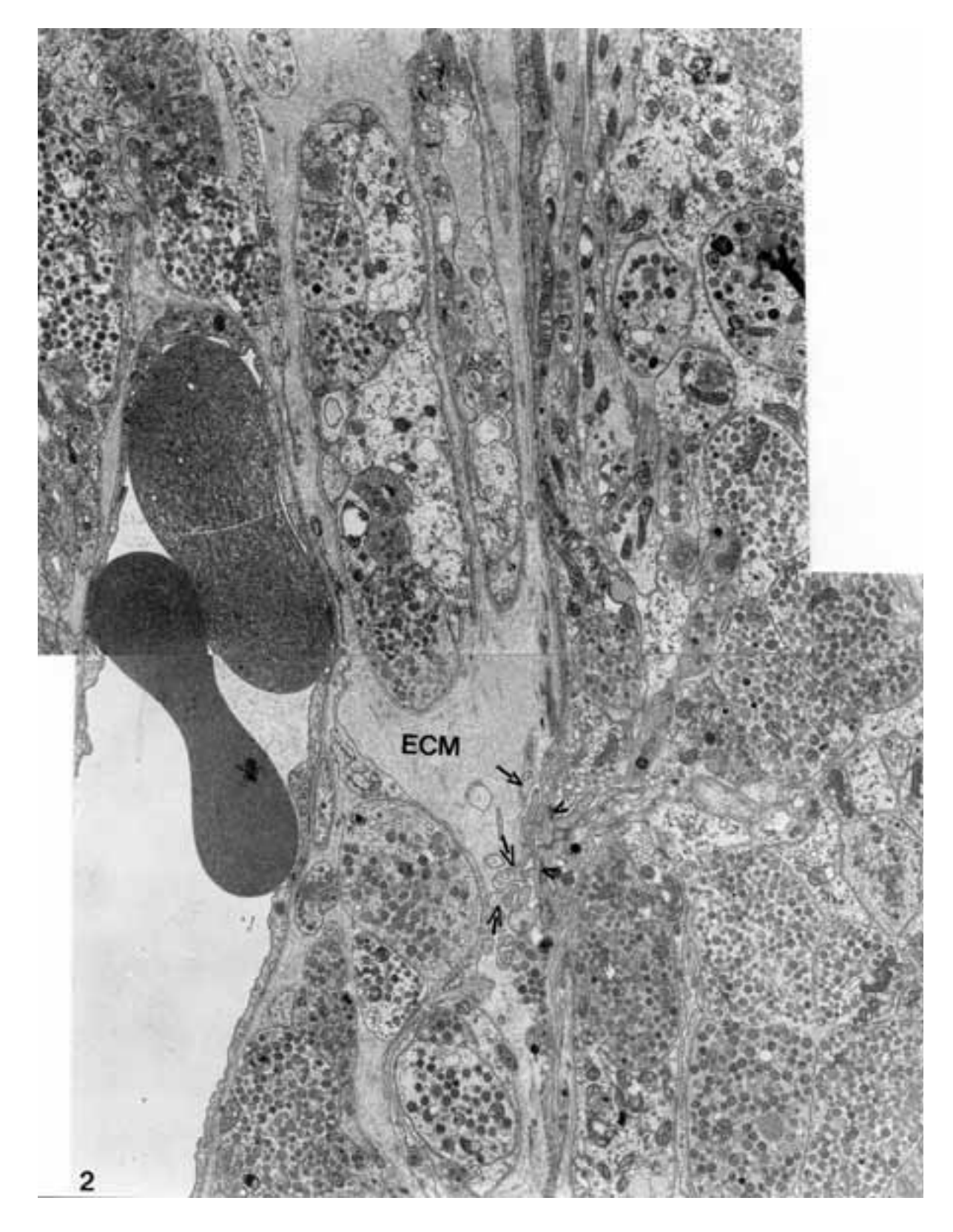
Fig. 2. Migration of endothelial cells (arrows) in ultrastructurally changed ECM. Connections between migrating endothelial cells (arrow heads) are seen. Migrating endothelial cells are accompanied by perivascular cell (asterisk). x15000