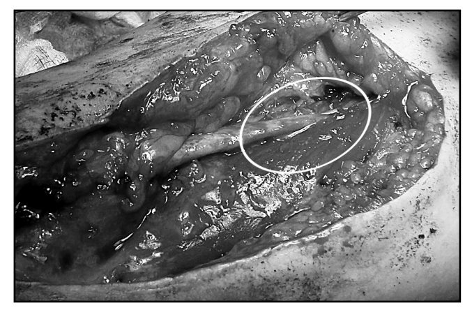
Fig. 3. Electrode placed underneath the ulnar nerve.

tation. Via an extension cable the stimulation electrode was connected with the implantable pulse generator (Versitrel Synergy) placed in a subcutaneous pocket in the right subclavicular region (Figures 4 and 5). Postsurgery, the field stimulation parameters were assigned, as determined during the trial period and the patient was instructed on how to handle the system. Three weeks after the PNS implantation the patient reported