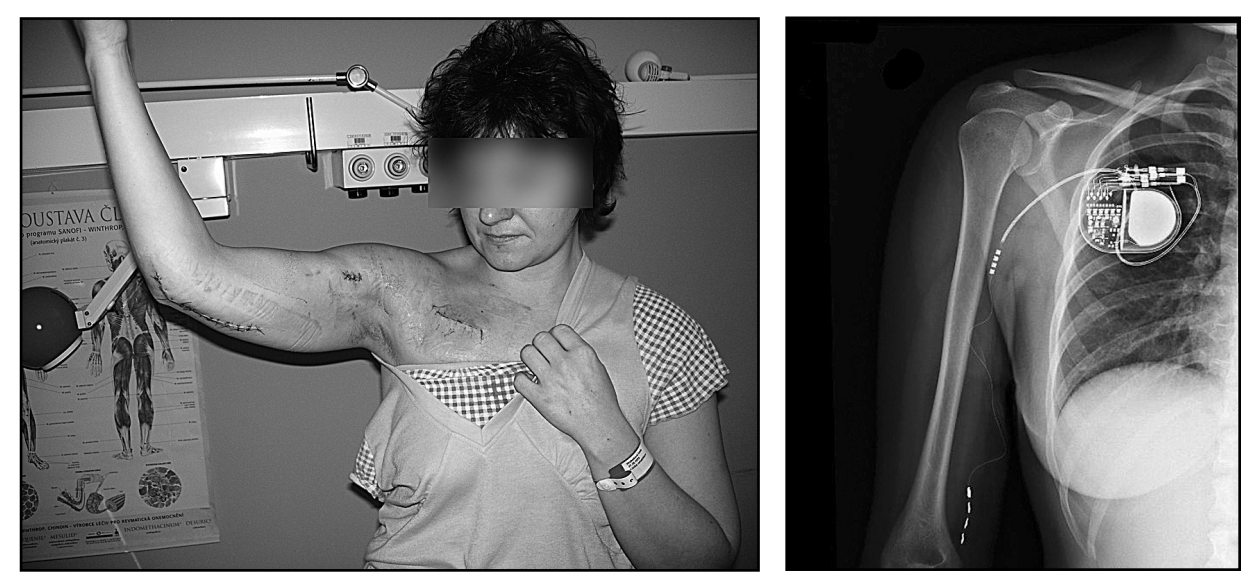
Figs. 4 and 5. Final position of the PNS system.

considerable pain relief, 0-1/10 during the stimulation and to 3-4/10 in the course of post-stimulation effectinterval. Pain medications, including opioids, discontinued though pregabalin ( 3\times300 mg) and amitriptyline (25 mg nightly) is still taken. However, this medication is expected to be discontinued gradually, during further check-ups. The patient reports being very satisfied with her pain relief.