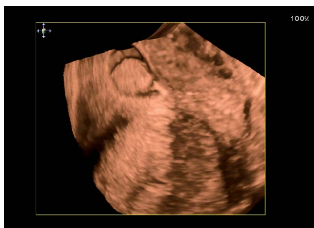
Fig. 3. The same polyp seen in SIS 3D.