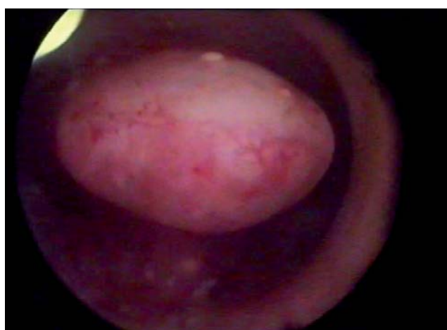
Fig. 4. The same polyp seen in hysteroscopy.

In the hysteroscopy all local changes (polyps, fibroids) were diagnosed. All the results are shown in Tables 1 and 2.